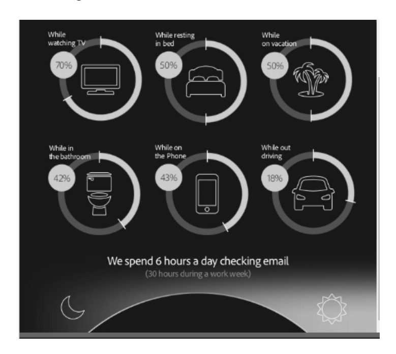
Figure no. 2. The time spent by users on checking email

social feature of modern consumers. As it can be seen from an Adobe research, adults are spending on average 6 hours per day to check emails, from 30 hours during a work week.