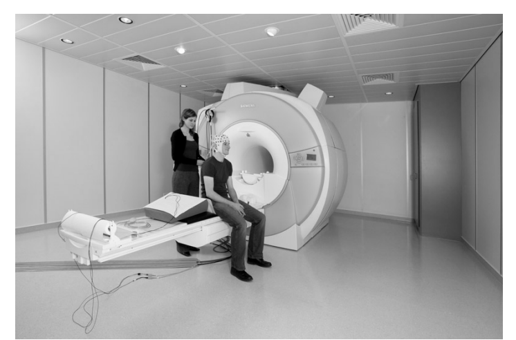
Source: Inauguration du Brain Behaviour Laboratory 12 mars 2009 Photos: Dorothée Baumann