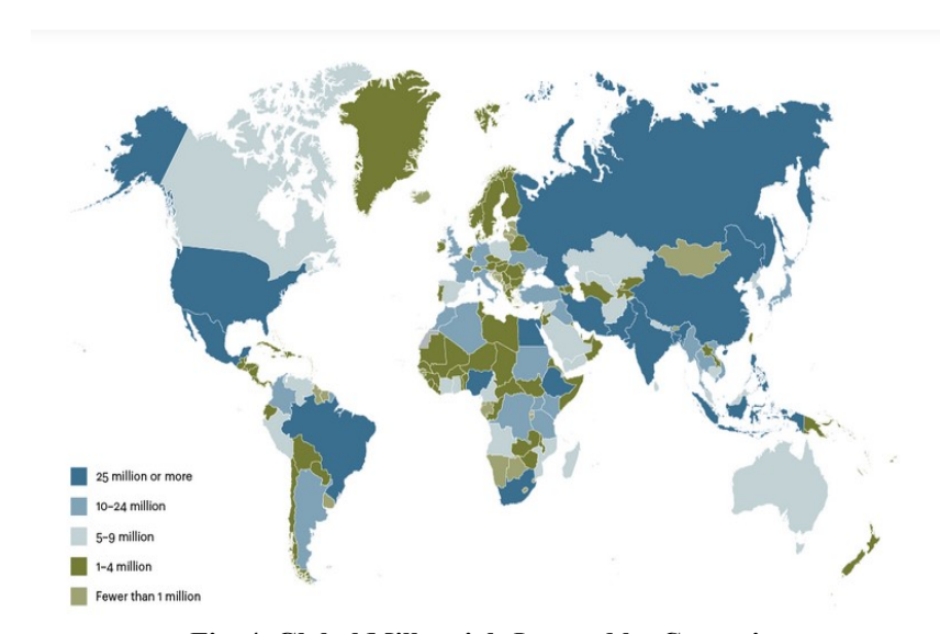
Fig. 4. Global Millennials Located by Countries

mindset', by considering the events that have affected them, their values and their consumer choices outside the travel industry. It's also important to remember that millennials in different parts of the world are going through different experiences; there are some things that unite them, and others that cause them to behave differently when they travel. Therefore, I believe that it's essential to take a step back and look at millennials as consumers, their life choices, their experiences. [Gen C Traveller, 2018]