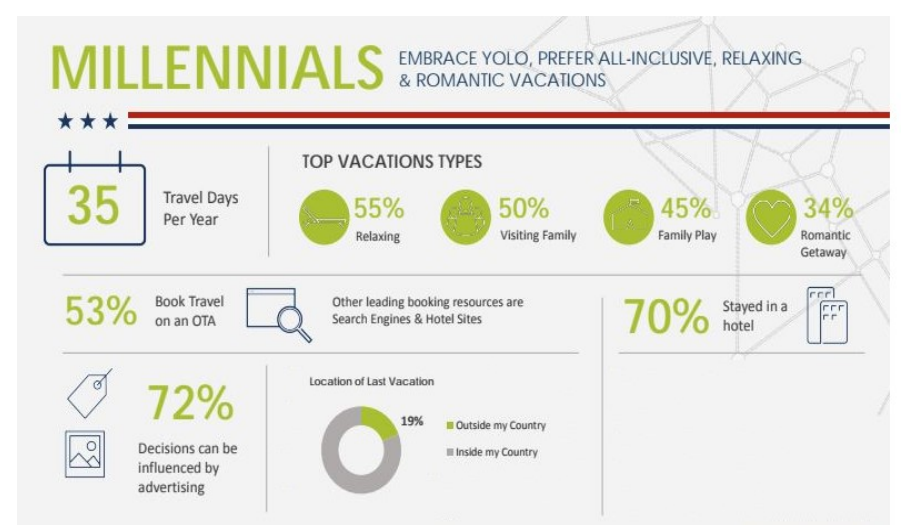
Fig. 2. Millennials Vacations Types

Millennials love to travel, not only are they inclined to take extended-stay trips that encourage cultural immersion, but they also enjoy booking spontaneous weekend getaway whenever possible. Given the fact that many millennials are delaying marriage and having children, they often have more discretionary income to spend than other generations and travel is typically a top priority. They would rather book a trip than purchase a nicer car or a luxury home product. [Rezdy, 2018]